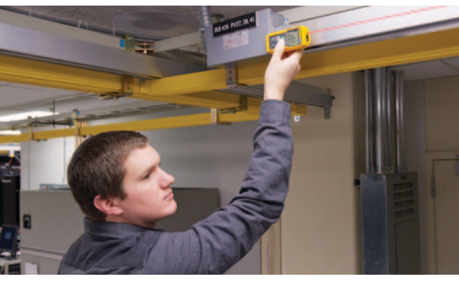
Measuring hard to reach areas.