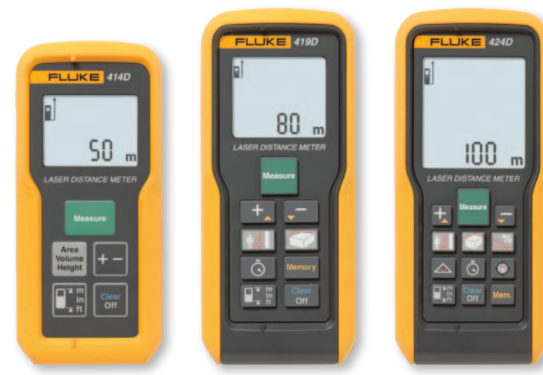
Fluke 414D, 419D and 424D Laser Distance Meters.