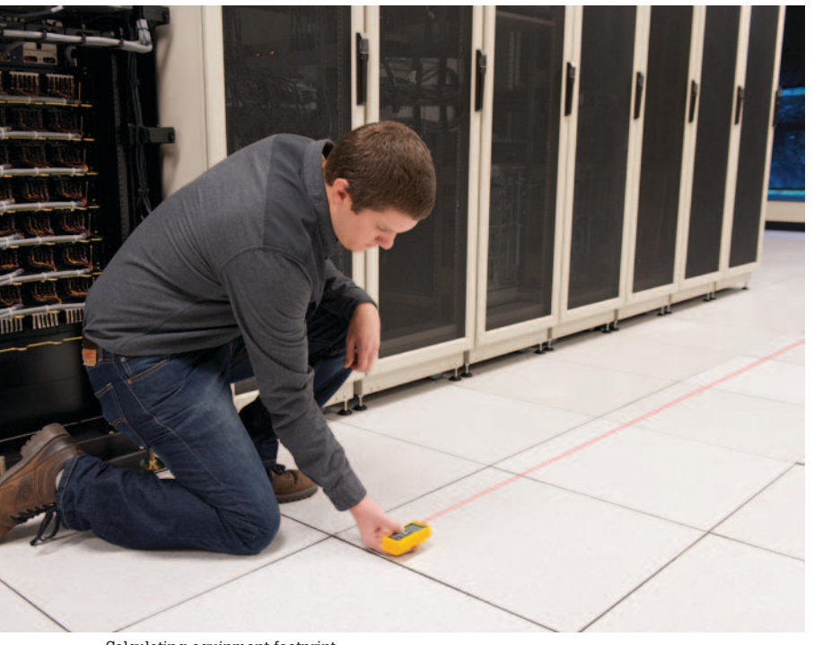
Calculating equipment footprint.