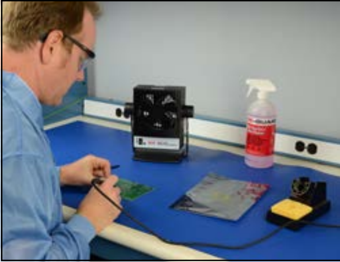
Figure 2. Using the 963E Benchtop Air Ionizer