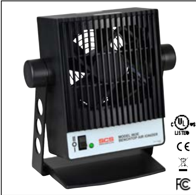
Figure 1. SCS 963E Benchtop Air Ionizer