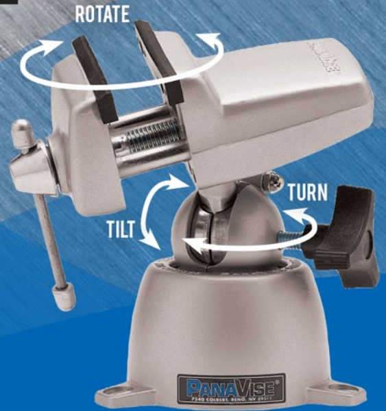
Model 301 STANDARD PANAVISE