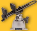
Wide Opening Head PanaVise | Model: 396