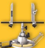
Electronic Work Center Model: 324