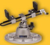
Multi-Purpose Work Center | Model: 350