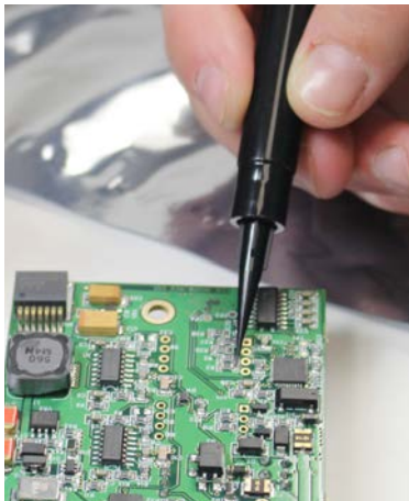
Apply extremely accurate, precise micro-deposits with ESD-safe dispensing tips.

Nordson EFD's Optimum® ESD-safe black dispensing components prevent static buildup when dispensing adhesives, pastes, coatings, and other assembly fluids used in manufacturing electronic products.