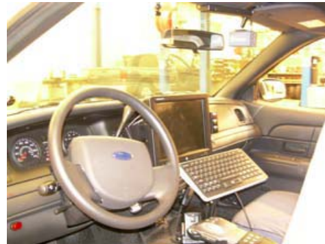
Ohio State Patrol car with voice activation system

One vehicle was being equipped with newly innovative voice activated controls. Technology has significantly increased from the humble beginnings of a simple car radio used for emergency service. I finally asked the question gnawing at my engineering mind. How do you prove the patrol car radio is working, when the installation is complete? Eric showed me a lot of test equipment which they use for test and measurement purposes and among this equipment is a Bird 43.