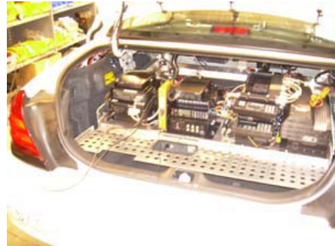
Communication equipment in trunk

Others were installing practically every piece of equipment from PC's to cameras, and naturally that pesky radar equipment. Due to the massive amount of electronic equipment needed in the state-of-the-art patrol vehicle, the trunk now serves as an electronic mounting compartment. This is a return of the 60's era where the equipment was originally mounted.