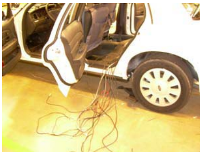
Cable bundle in process of installation

Before touring the facility, I assumed that the vehicle manufacturer installed the cable bundle to facilitate the multiple radios needed. The installation crew would then simply bolt the radio in the car, plug in the cable, and bolt on an antenna. My assumptions were entirely incorrect. Upon entering the service area, there were multiple vehicles in various stages of the installation process. A fleet of vehicles in almost every stage of the installation process were present. Some vehicles were absolutely bare except for the person installing the cables. Cables were routed from the console area to the trunk and from the rooftop to the multiple antenna locations.